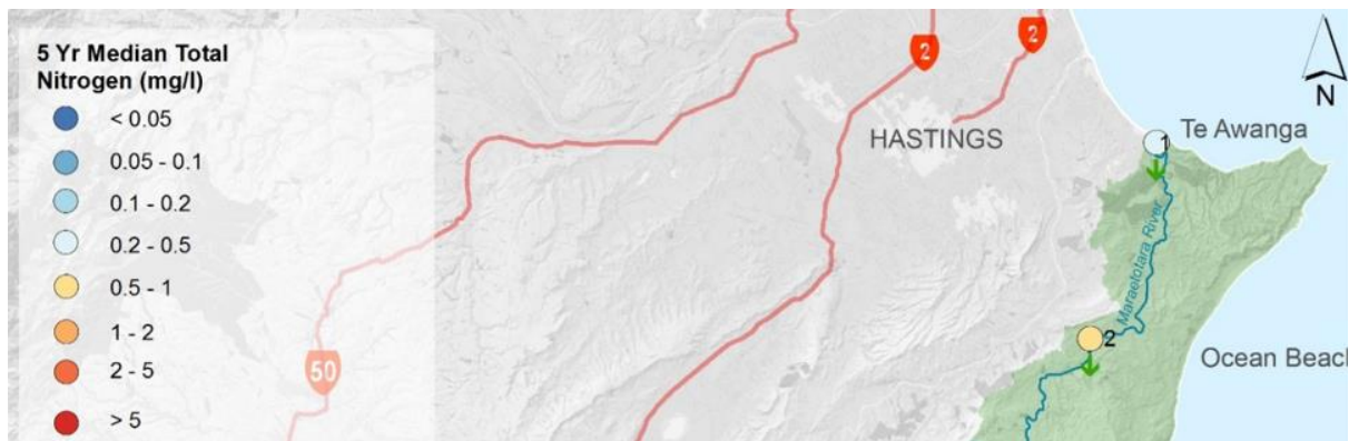
5 year median and trends in total nitrogen (TN) concentrations

The Maraetōtara River (at Waimarama Rd) (0.87mg/L) had elevated median TN concentrations.