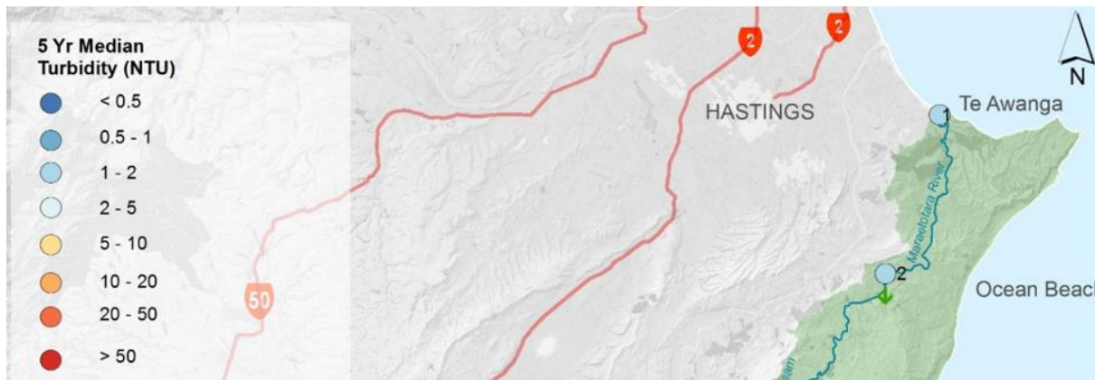
5 year median and trends in Black Disc (BD) water clarity at SOE monitoring sites