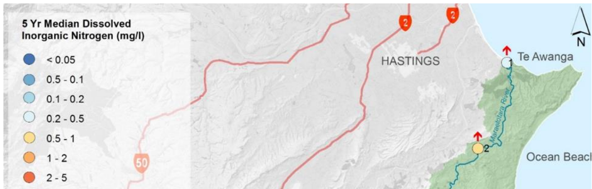
5 year median and trends in dissolved inorganic nitrogen (DIN) concentrations at SOE monitoring sites

Increases in DRP concentrations were identified for the Waingongoro Stream (4.91%) and the Maraetōtara River at Waimarama Rd (10.03%) and at Te Awanga (19.12%).