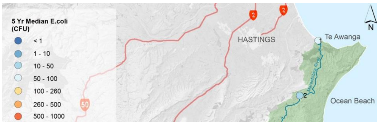
5 year median E. coli concentrations at SOE monitoring sites including trend direction.

Escherichia coli (commonly abbreviated as E. coli ) concentrations have been routinely monitored throughout the Porangahau and Southern catchments as an indicator of microbiological water quality. E. coli is a bacterium commonly found in the lower intestine of warm-blooded animals and is an important indicator of the presence of pathogens of faecal origin in the water. E. coli is used to assess the level of health risk to water users having direct contact with water. The Maraeotara River (at Waimarama Rd) ranked in the top 40%, of all Hawke's Bay regional sites.