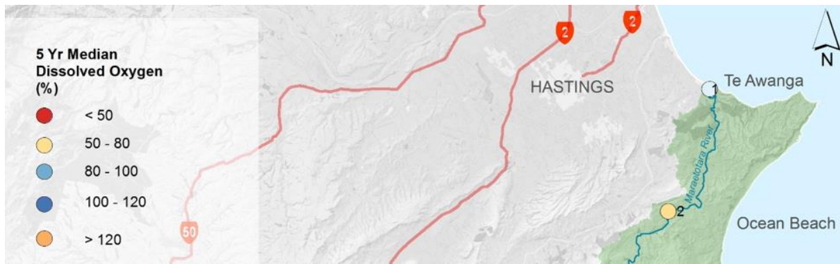
5 year median dissolved oxygen % saturation levels at SOE monitoring sites