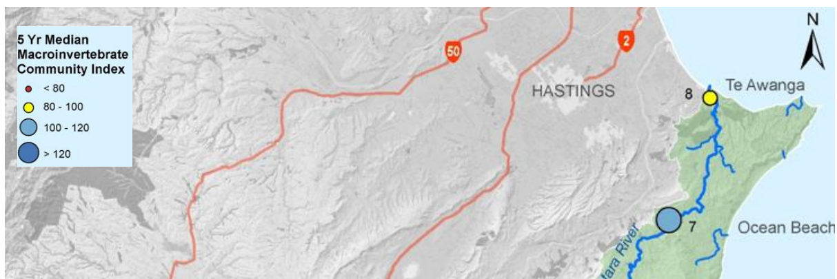
5 year median Macroinvertebrate Community Index (MCI) scores at SOE monitoring sites.

Benthic macroinvertebrate communities are the assemblages of insects, crustaceans, worms and molluscs that live on the bottom of streams and rivers. Macroinvertebrate communities are commonly used as state indicators of water quality and ecosystem health. The macroinvertebrate community of a stream adjusts to conditions in the aquatic environment, including naturally induced changes and stressors affecting ecosystem health. The macroinvertebrates collected at a site are exposed to changes in conditions at that site for periods of months, to a year or even several years, depending on their life cycle. When under stress, the community composition changes as sensitive species are lost, and more tolerant species appear, which leads to a community dominated by more tolerant species. Both human activities and natural changes such as drought and floods, or natural variations in stream bed substrate type and water temperature may affect macroinvertebrate communities. Assessing the composition of macroinvertebrate communities provides a long-term and integrated view of stream ecological health.