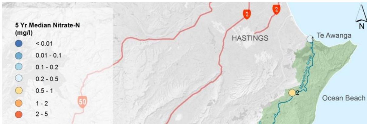
5 year median and trends in nitrate-nitrogen (NO 3 -N) concentrations at SOE monitoring sites