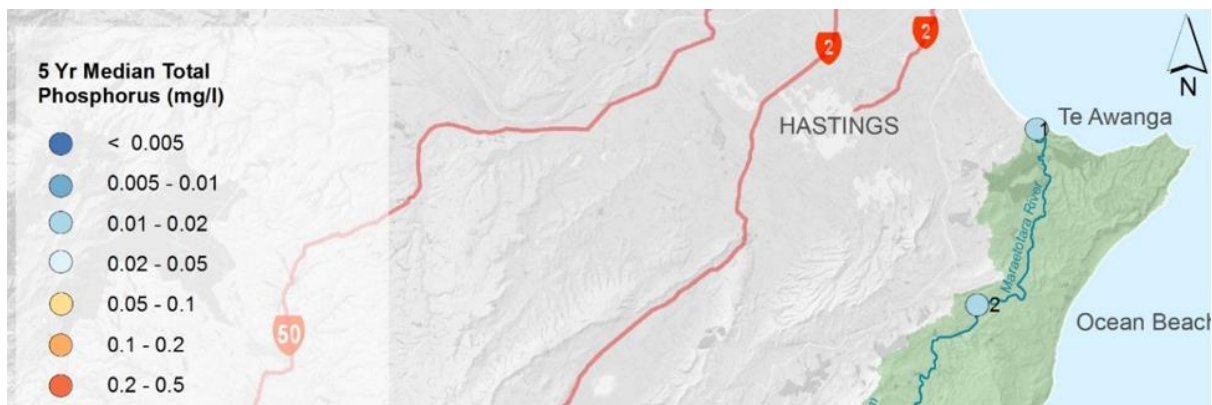
5 year median total phosphorus (TP) concentrations at SOE monitoring sites