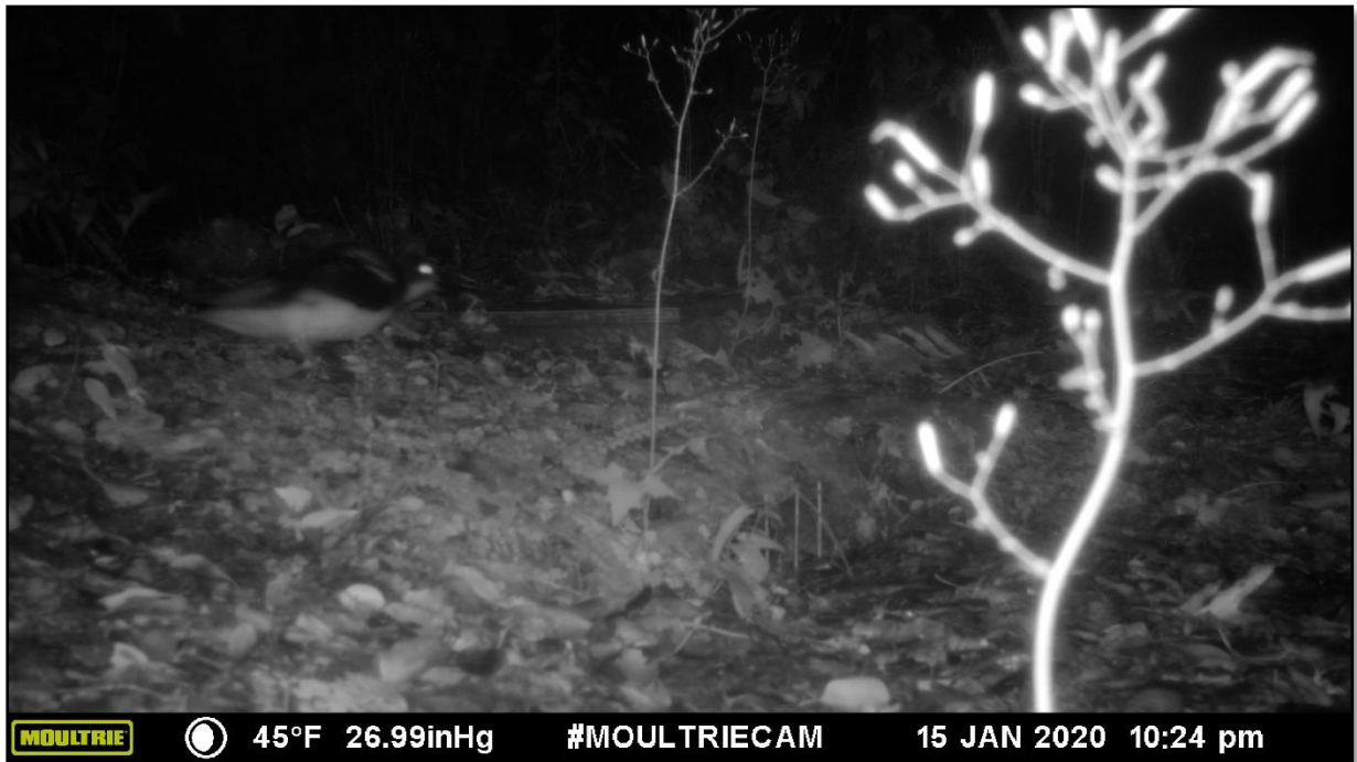
Motion sensitive camera image showing a tītī returning in January.

Over the last six months there have been no further translocations, but kaka and seabirds continue to be monitored.