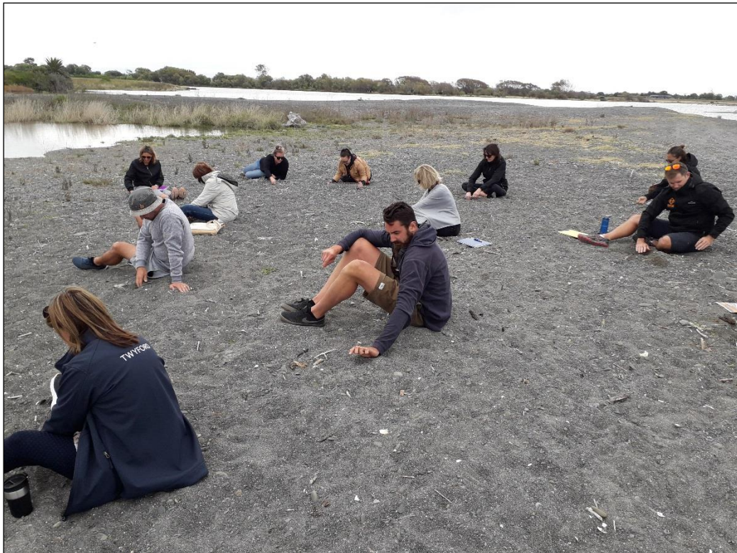
Teachers making dotterel nests as part of a teacher professional development workshop

Native species thrive where we live, work and play