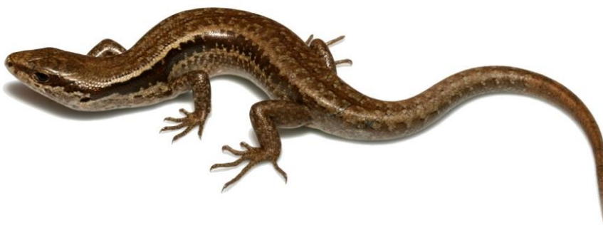
Small-scale skink ( Oligosoma microlepis ); 'Threatened – Nationally Vulnerable'.