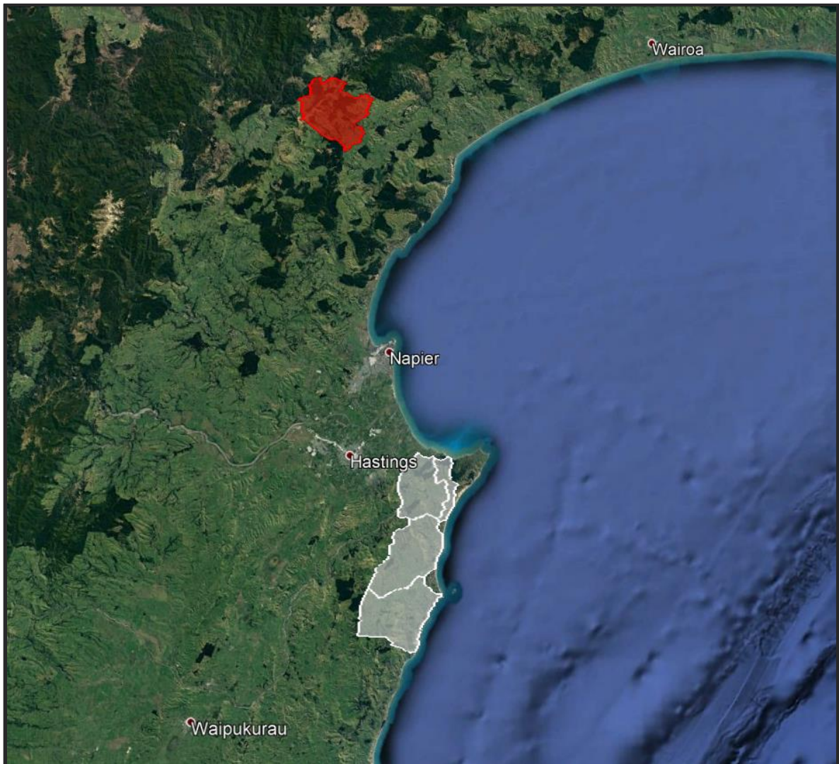
Figure 1. Location of Cape to City (white polygon) and Poutiri Ao ō Tāne (red polygon) in Hawke's Bay. Cape Sanctuary occupies the eastern-most area from Cape to City.

Poutiri Ao ō Tāne, the 'sister' project of Cape to City, is a joint ecological and social restoration project located in the northern Hawke's Bay (Fig. 1) in partnership with Maungaharuru-Tangitū Trust ( http://www.poutiri.co.nz/ ). Lake Opouahi and the Department of Conservation's (DOC) Boundary Stream Mainland Island is the focus of this project. Poutiri Ao ō Tāne aims to bring native flora and fauna back into the lives of the local people. The project plans to see the return of native species that have been lost to the area over time – and to see these species flourish, not only in the habitats in which we expect them to be, such as native bush, but also in the agriculture and forestry landscape.