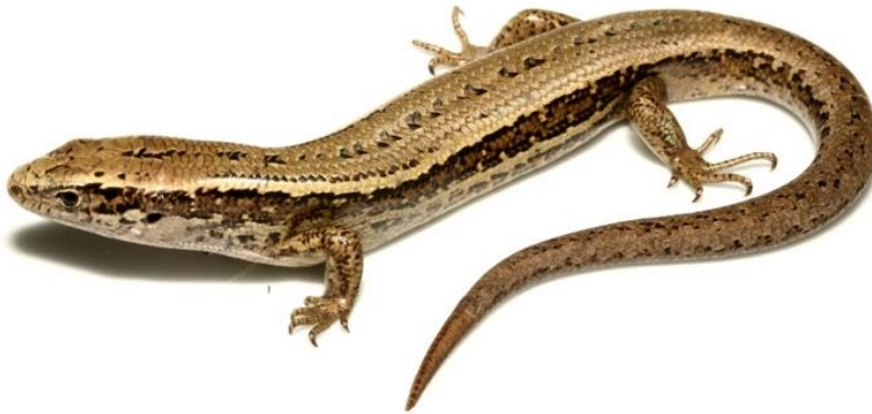
Cape Kidnappers skink ( Oligosoma aff. infrapunctatum ); 'Threatened – Nationally Vulnerable', possibly upgrade to 'Threatened – Nationally Endangered' (Photo credit: EcoGecko Consultants Limited).