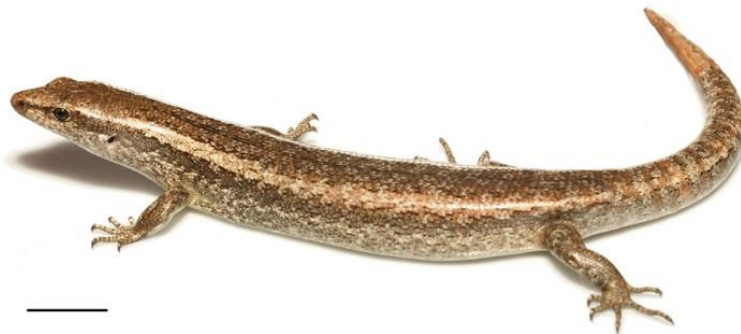
Shore skink ( Oligosoma smithii ); non-threatened (Photo credit: EcoGecko Consultants Limited).