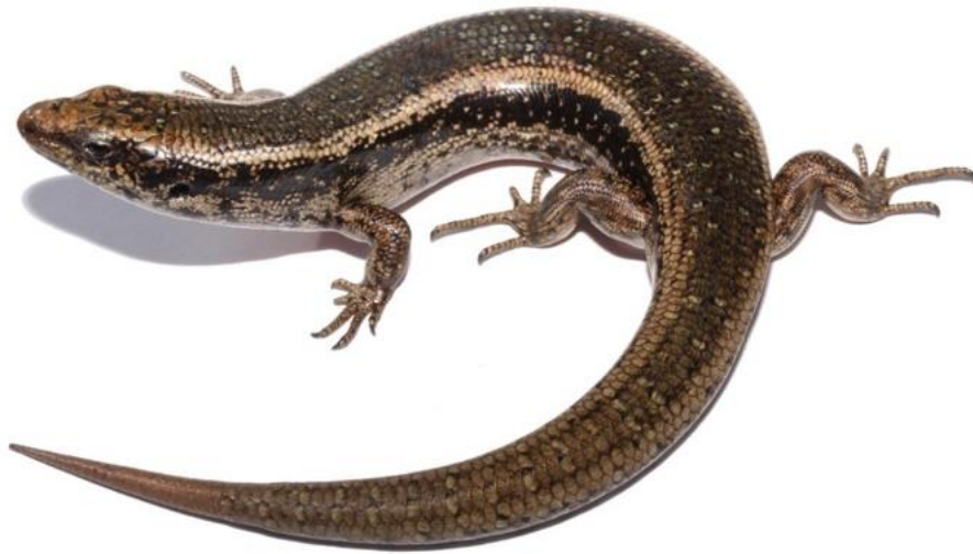
Northern spotted skink ( Oligosoma kokowai ); 'At Risk – Relict' (Photo credit: EcoGecko Consultants Limited).