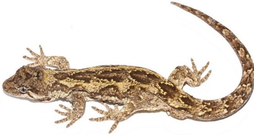
Ngahere gecko ( Mokopirirakau 'southern North Island'); 'At Risk – Declining'.

Photographs approximate life size for adult.