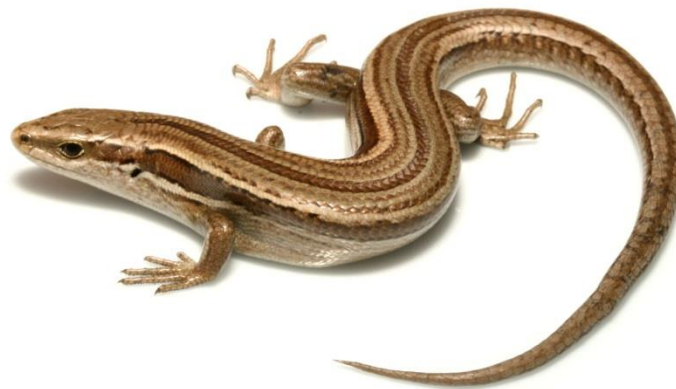
Northern grass skink ( Oligosoma aff. polychroma Clade 1a); non-threatened (Photo credit: EcoGecko Consultants Limited).