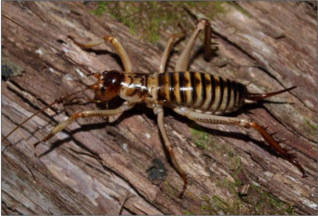
Hemideina trewicki , Hawke's Bay tree wētā (Photo credit: Mike Lusk).