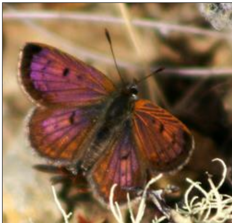
Lycaena boldenarum , Boulder Copper butterfly (Photo credit: Mike Lusk).