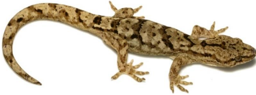
Raukawa gecko ( Woodworthia maculata ); non-threatened (Photo credit: EcoGecko Consultants Limited).