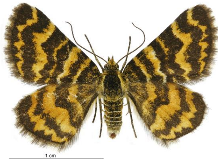
Notoreas perornata.